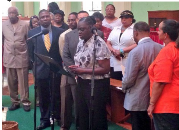
Brown Speaking with Media Calling for Justice regarding 137shots of two unarmed Blacks; Brown is surrounded by members of the clergy